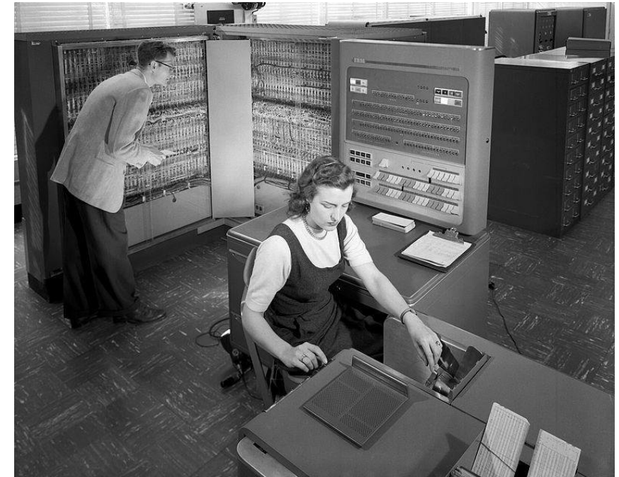
January 7, 1954, Georgetown-IBM experiment